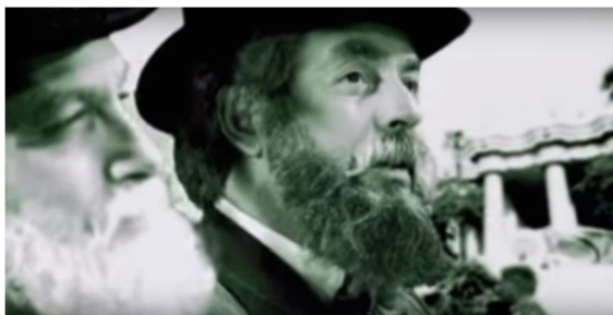
Photogram of “Güell i Gaudí, un projecte comú”, by Joan Riedweg

In its 20 minutes of duration this film shot in Catalan narrates some conversations between Eusebi Güell and Gaudí, performed by Abel Folk and Ramon Madaula respectively. The action takes place during some carriage rides in four different stages of the relationship between these two great characters.