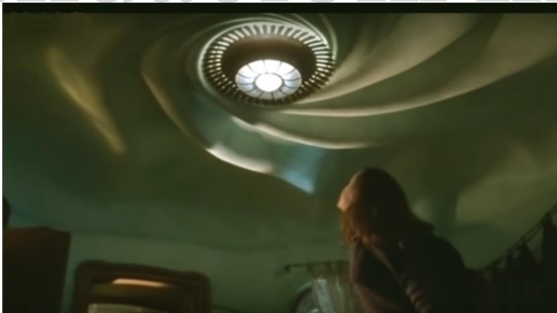
Photogram of "Casper" showing the reproduction of the ceiling of the living room of Casa Batlló

In this house many of its rooms literally reproduce elements of Gaudí's works: Windows and doors and the spiral ceiling of Casa Batlló, carpentry of La Pedrera and columns inspired by Palau Güell and Casa Calvet, as well as parabolic arches reminiscent of Teresian College.