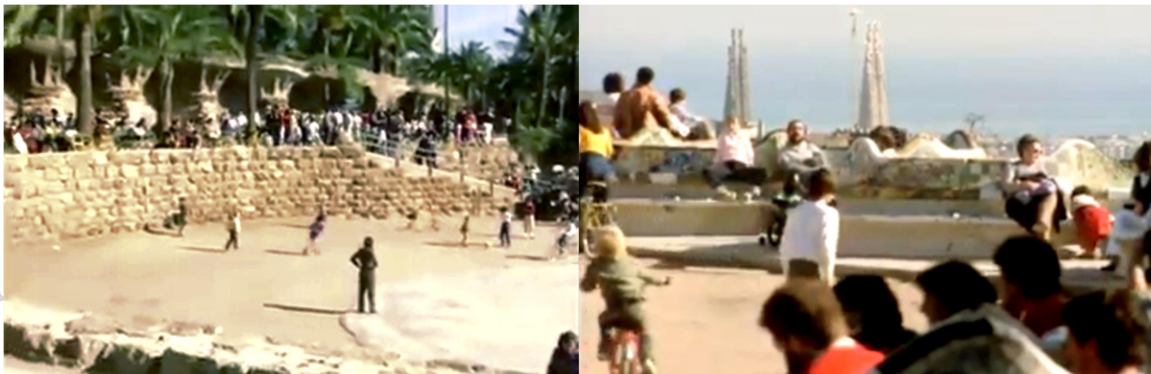
Photograms of "Antoni Gaudí", by Hiroshi Teshigahara

Shot in 1961 by director Ken Russell for a series of 21 BBC documentaries about art. His interest lies in being the