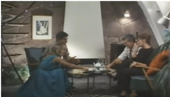
Photogram of "Últimas tardes con Teresa", showing the interior of one of the apartments in the attic of La Pedrera