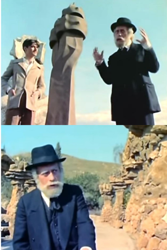
Photograms of "Antoni Gaudí, una visión inacabada", by John Alaimo

was ceded to the Filmoteca de Catalunya.